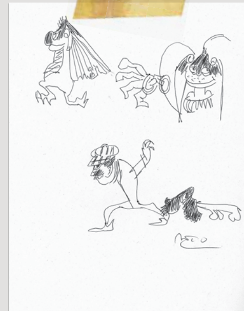
Drawing of characters signed by Fellini