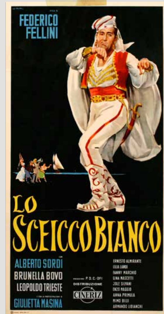
Lo Sceicco Bianco: Italian poster