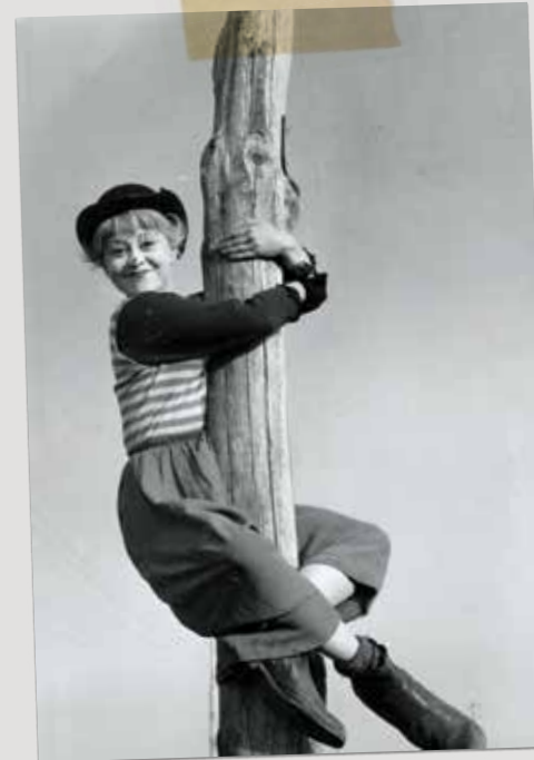
Gelsomina (Giulietta Masina)