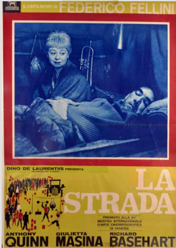
La Strada: Italian poster