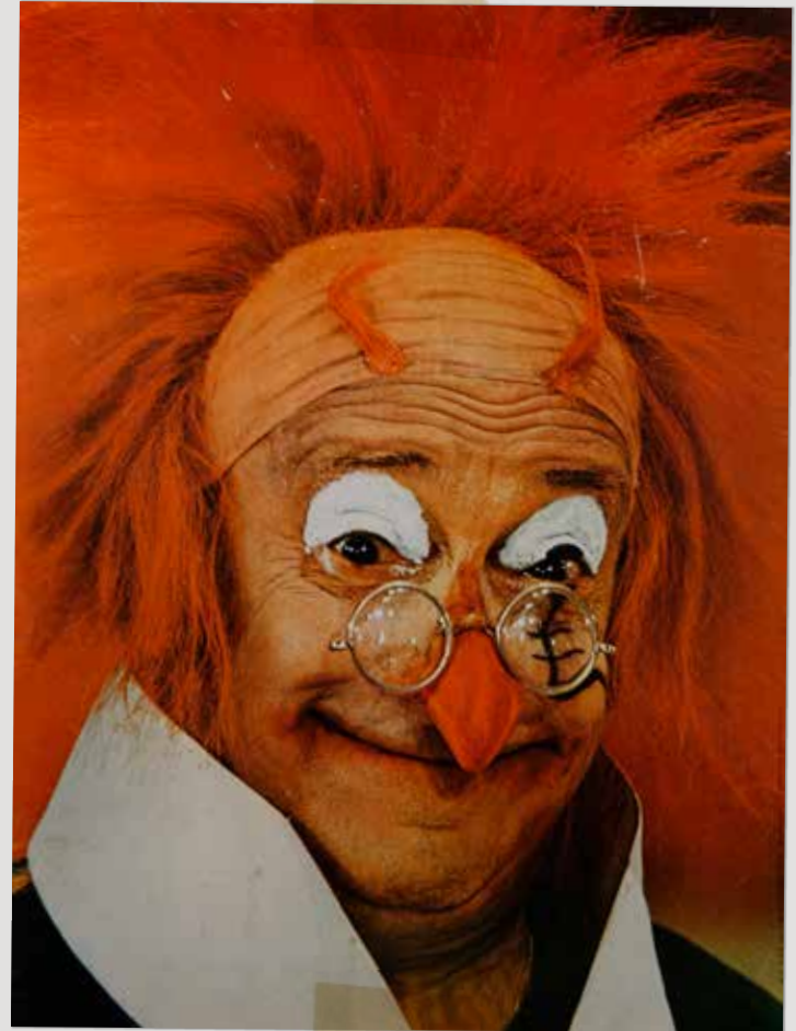
The Clowns: Photograph