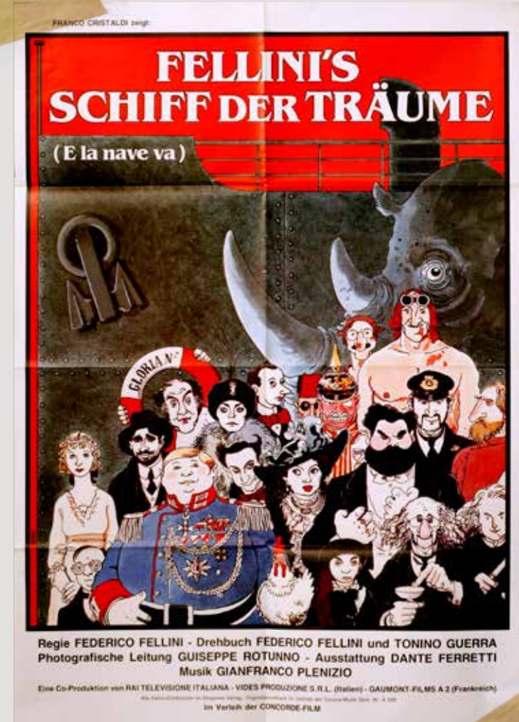
E la Nave va: German poster