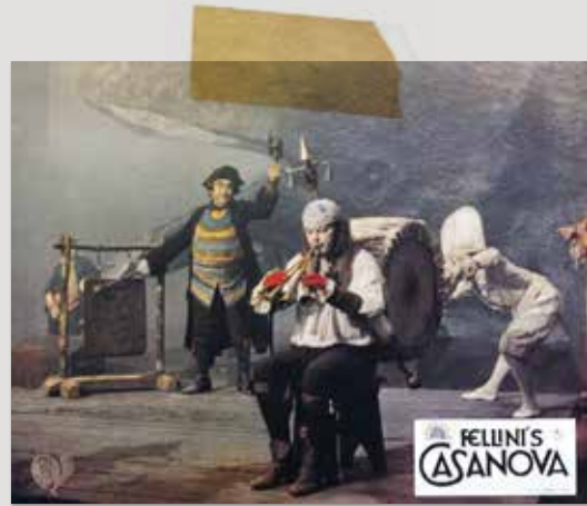
U Casanova di Fellini: photo material