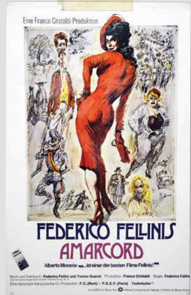
Amarcord: German poster