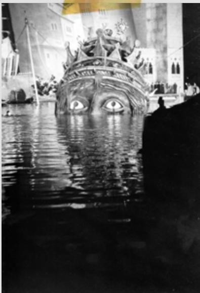
Scene from the Carnival of Venice in Cinecittà