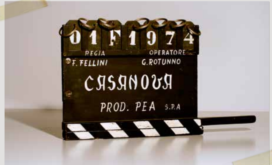
Original clap - Il Casanova di Fellini