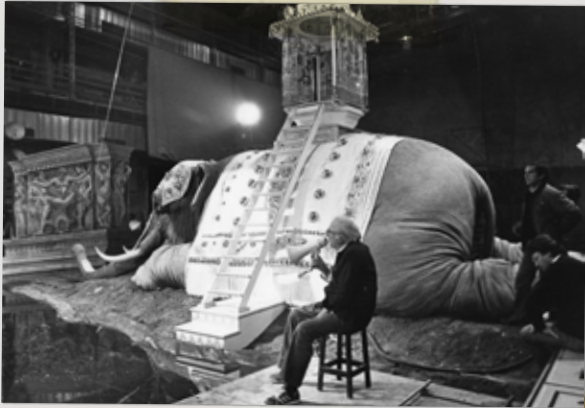
Fellini on the set in Cinecittà, Intervista