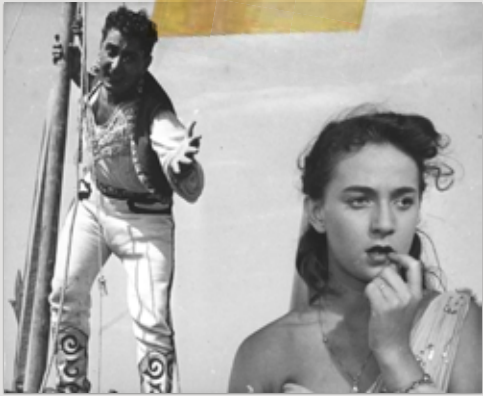
Alberto Sordi and Brunella Bovo Lo Scicco Bianco