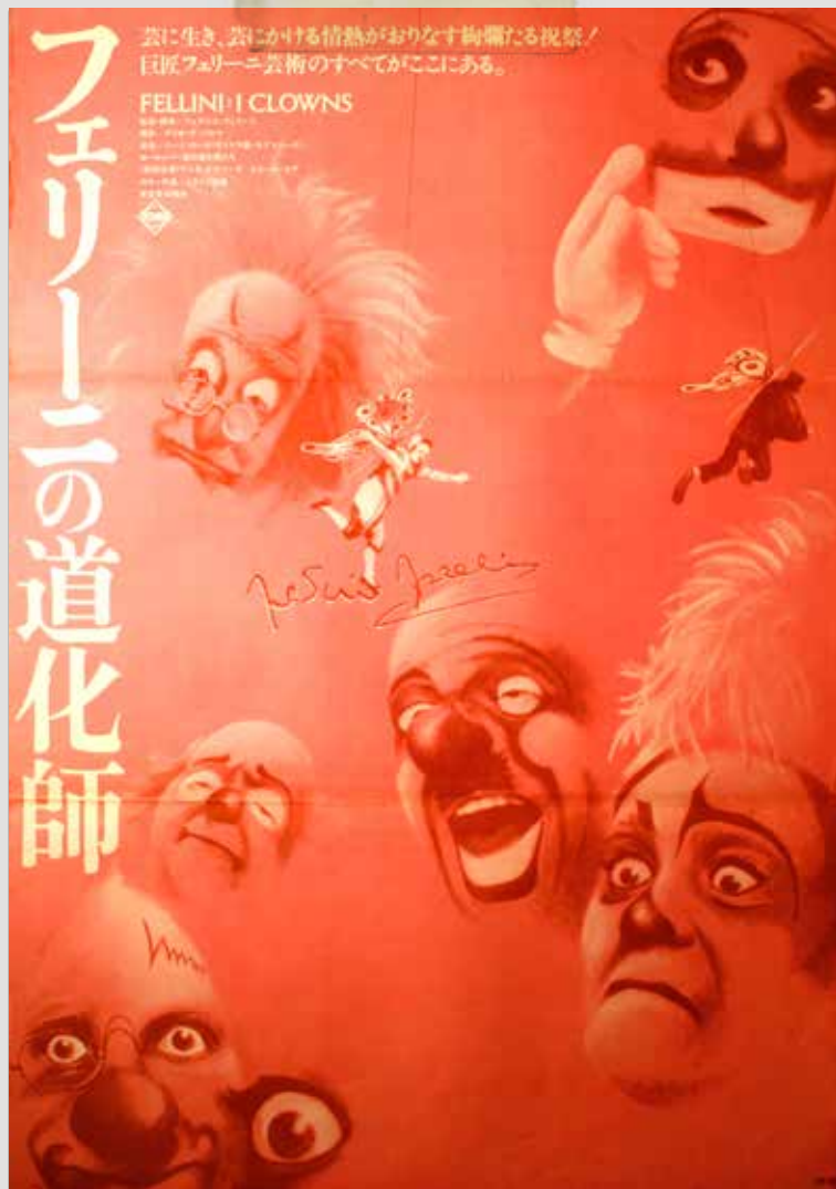
Clowns, Japanese poster