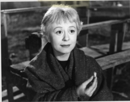
Gelsomina (Giulietta Masina)