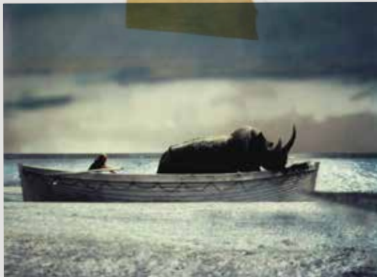
Final scene E la Nave va, set in Cinecittà