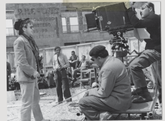
Fellini with the Mad (Richard Basehart) on the set La Strada