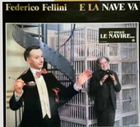
Photo material scene from E la Nave va