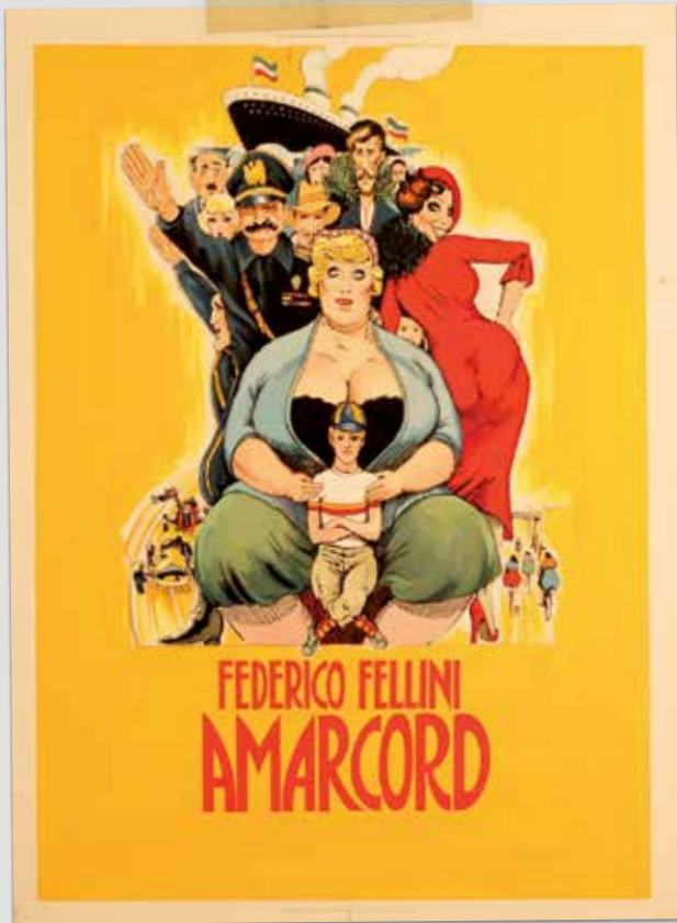
Amarcord: Italian poster