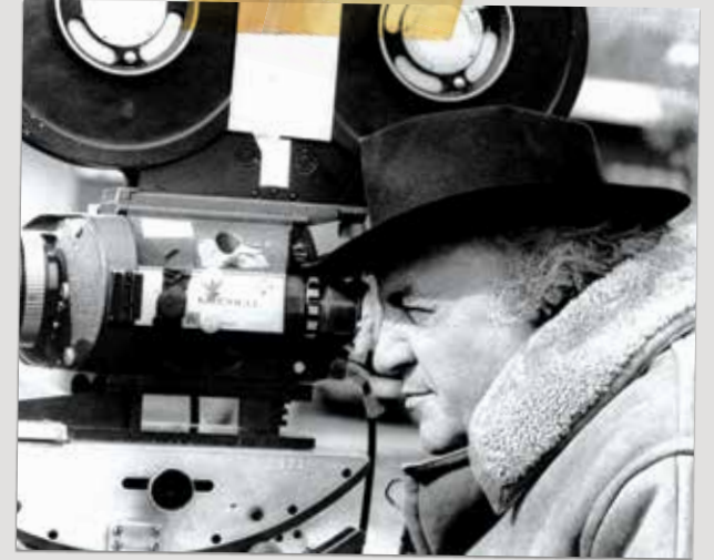
Fellini with the camera Mitchell