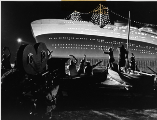
Fellini with the Gradisca (Magali Noël) on the set Amarcord