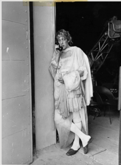
Donald Sutherland between two shootings in Cinecittà, Il Casanova di Fellini