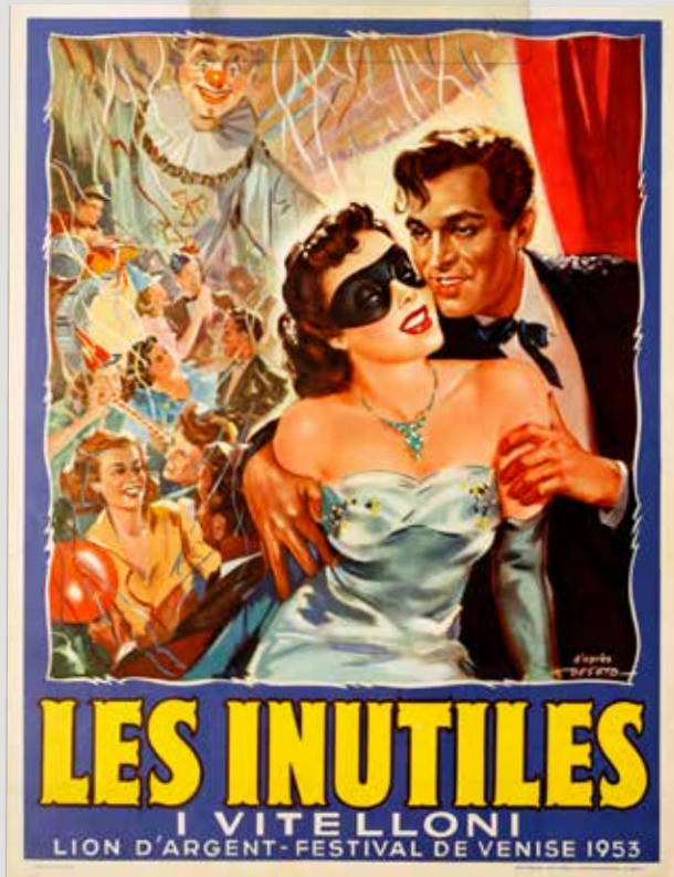
I Vitelloni: French poster