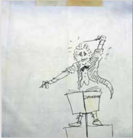
Original drawing by Fellini on a napkin