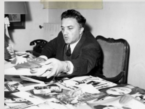
Fellini and the castings, at the time of La Dolce Vita