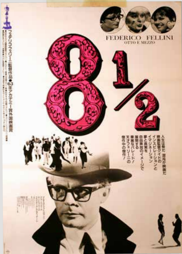
11 8 1/2: Japanese poster